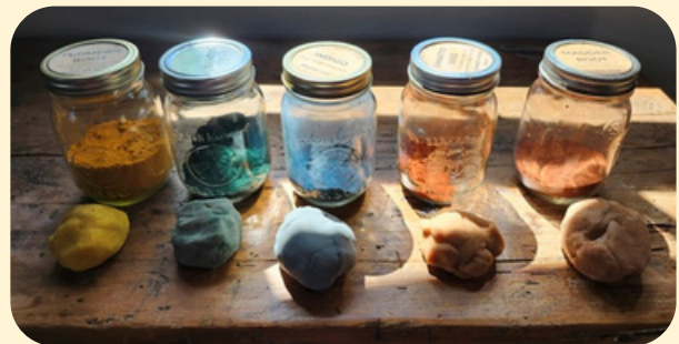
Play Dough made from Natural Plant Dyes